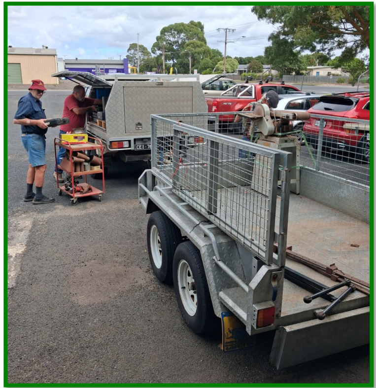
Nelson Mens Shed collecting excess equipment