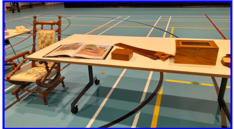
Redgum & other wood products