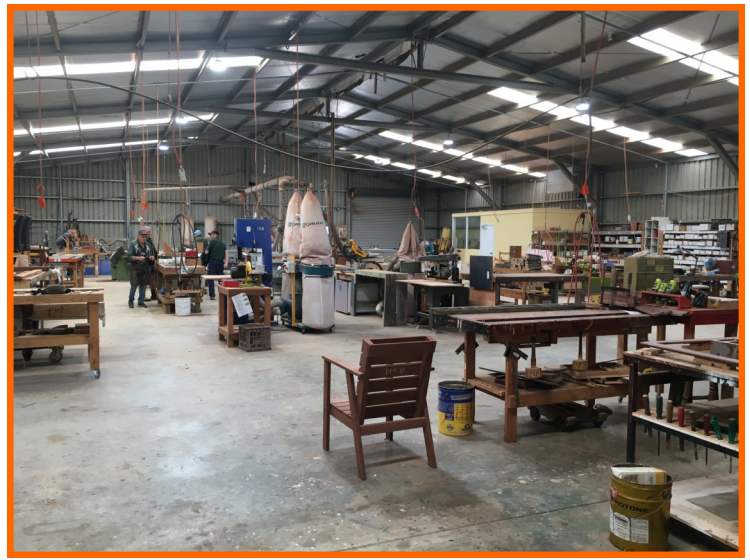
Esperance Men in Sheds wood working area