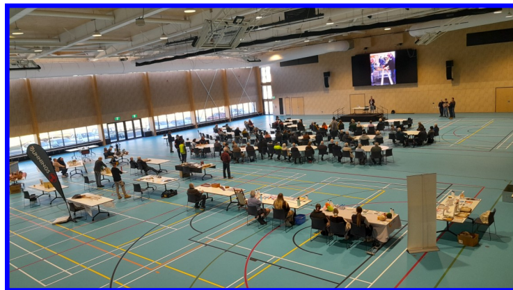
Wulanda event centre

The following pictures are from the Cluster Gathering Day