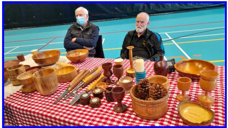
Wood turning & lathe tools made