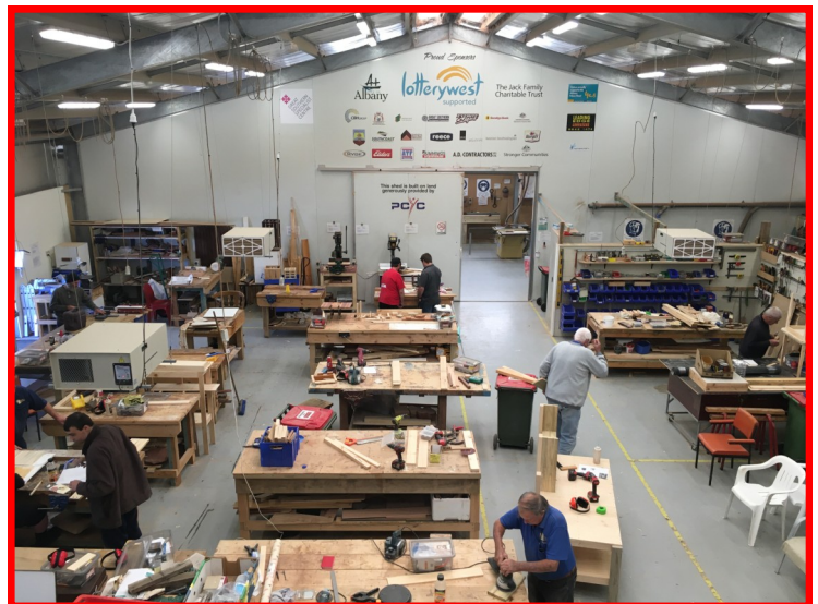
Albany Men in Sheds woodworking area, room behind door at far end is large noisy tool area