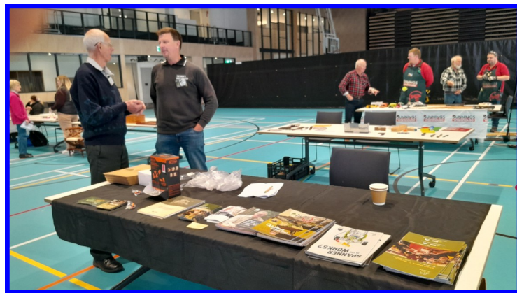
Australian Mens Shed Association