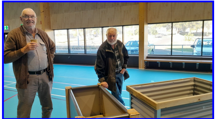
Raised garden beds