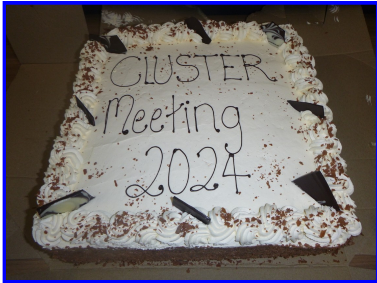
Celebratory cake donated by Sugar & Spice