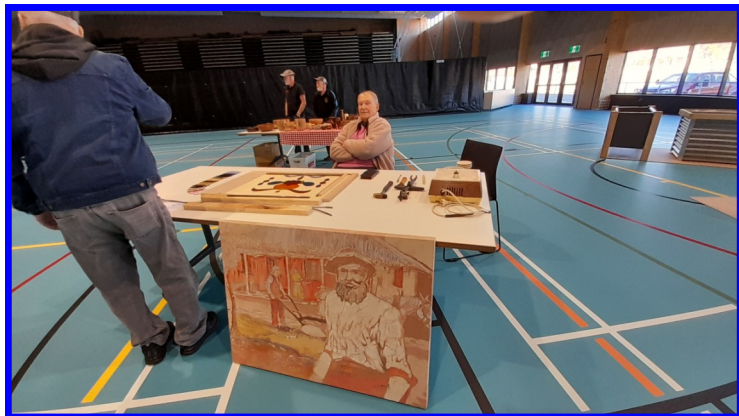
Lead Lighting & Painting