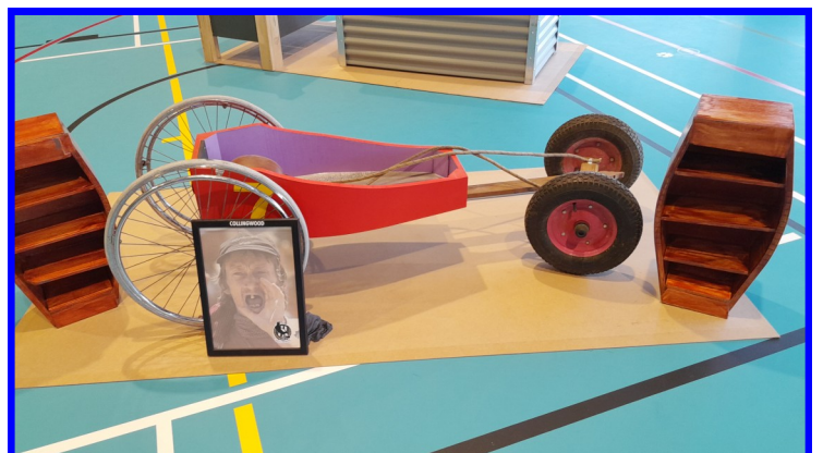
Display shelves & go cart