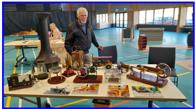
An assortment of creations