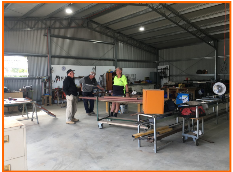
Esperance—half of new metal work shed

Everything I need to know about life, I learned from Noah's Ark . . .