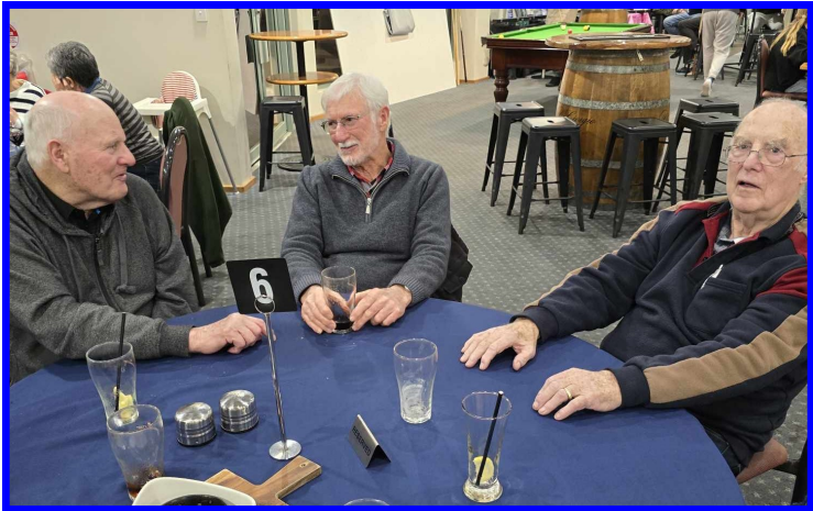
Above & below—Shedders & partners dinner at RSL