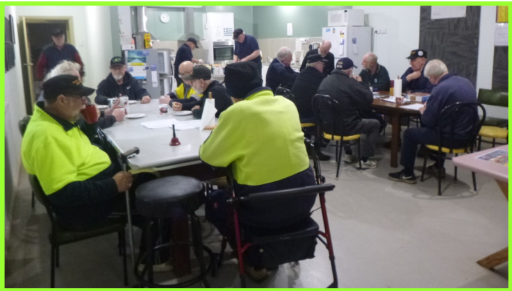
Part of the group of 35 gathered for morning tea of scones & a drink