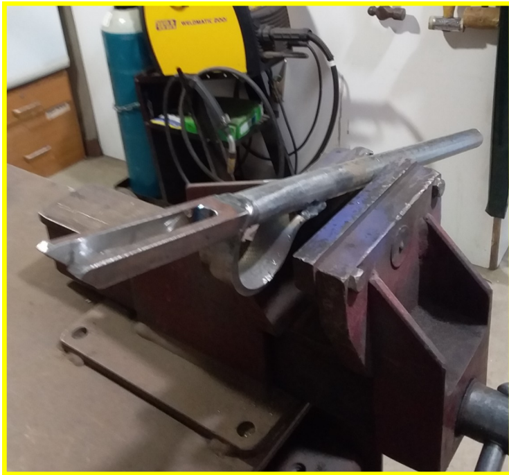
A garden weed lever made by Trevor A