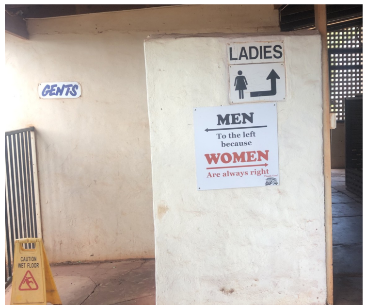
Toilets at Paynes Find WA