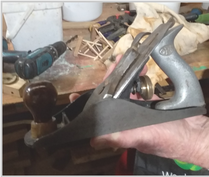
A very old jack plane refurbished by Jim G