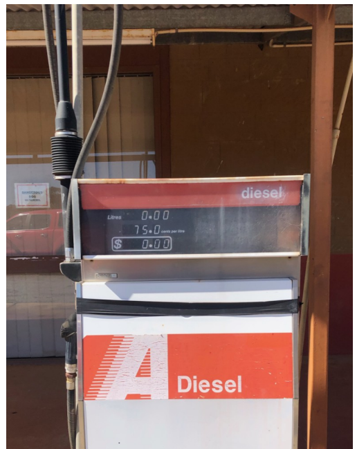
Check out the price! Pity the roadhouse at Bulla Bulling WA was closed & abandoned!