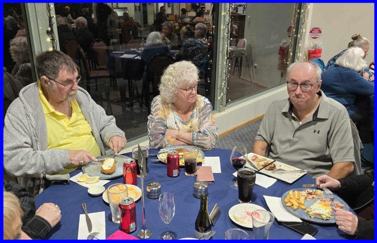
More dinner photos