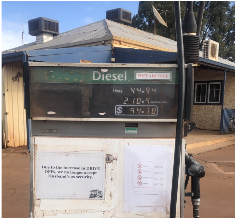
Check out the security notice on the bowser at Paynes Find WA