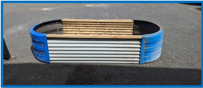
Back to an original style raised garden bed