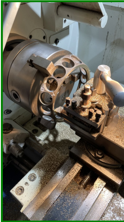
Trevor A repurposing ball race cages on the new lathe for part of a water fountain