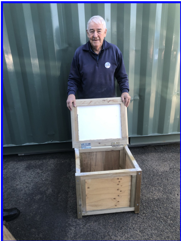
It is finished!