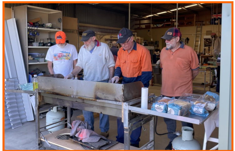
New sausage crew for BBQ day

For 10% discount, use code SENIORS10 at time of booking.