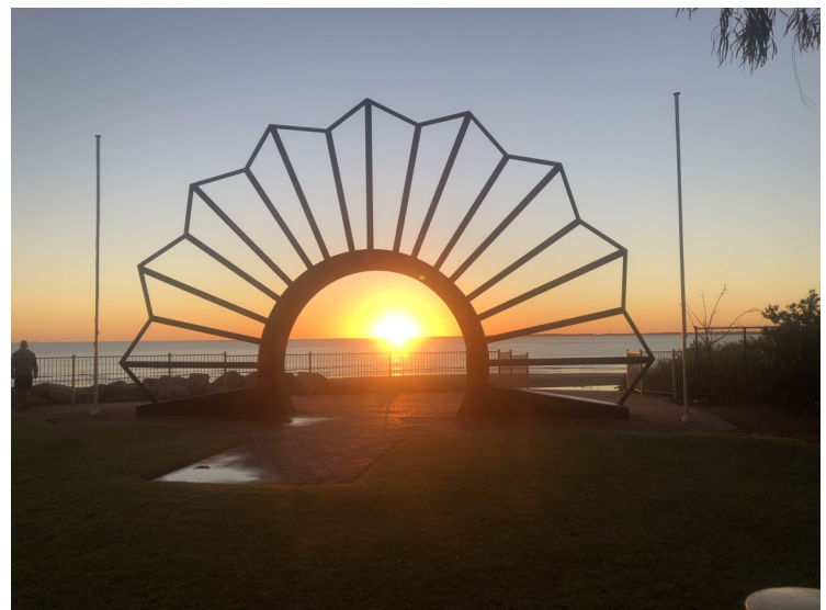
ANZAC Memorial, Onslow WA