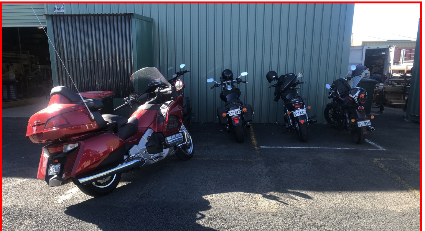
Some shedders arrive in style