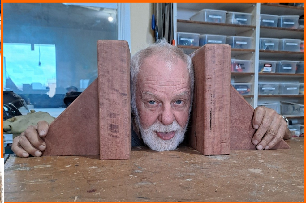
Herman B's heavy duty bookends made from red gum sleeper, put to good use