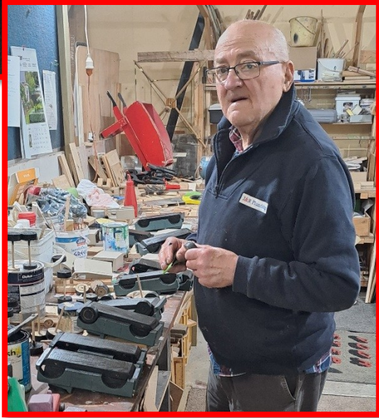
Land Rover assembly line right