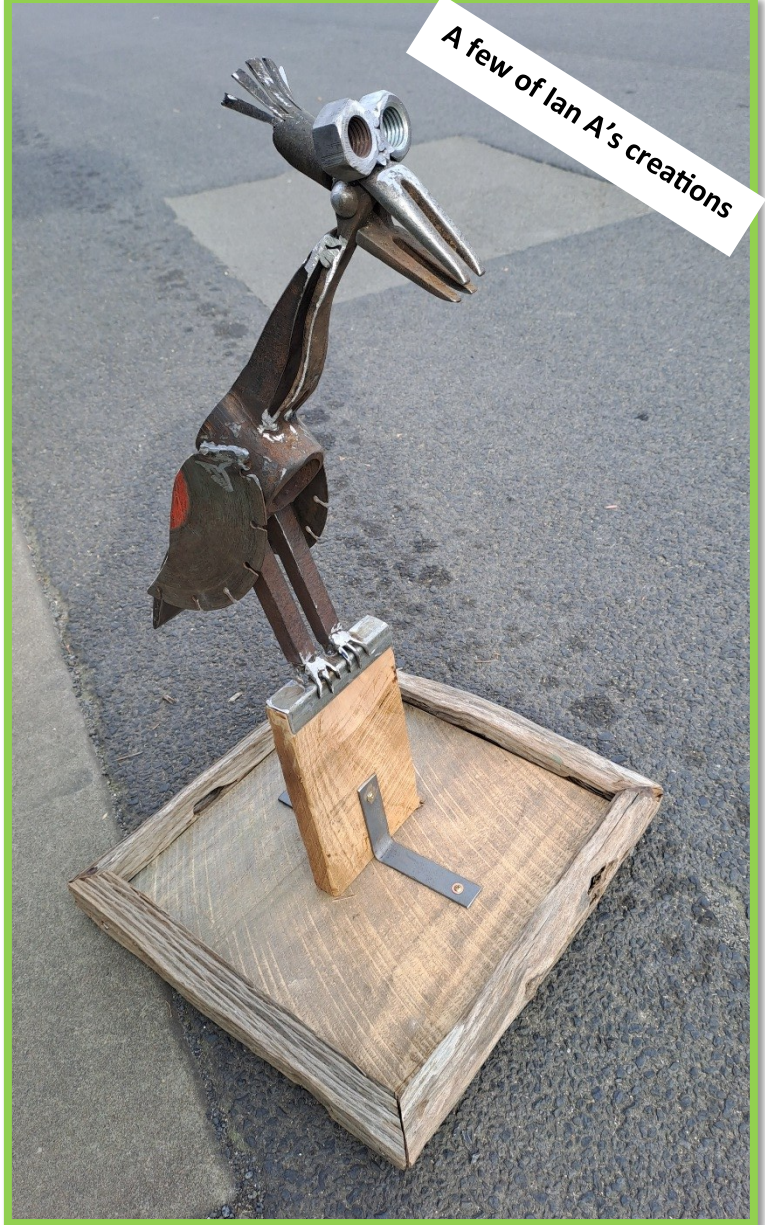
A few of Ian A's creations