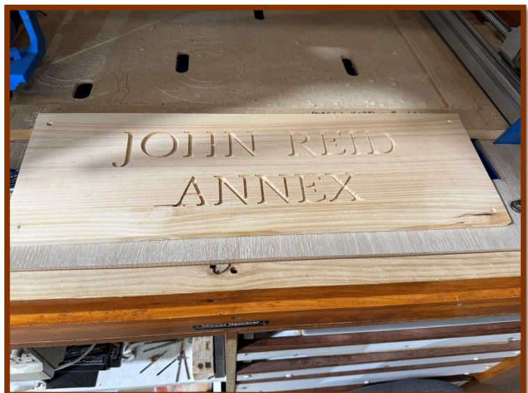
Helping Casterton Mens Shed with a CNC project

If at first you don't succeed . . . sky diving is not for you