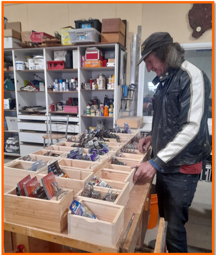
Hmmm, what can I make from this lot? Russell S