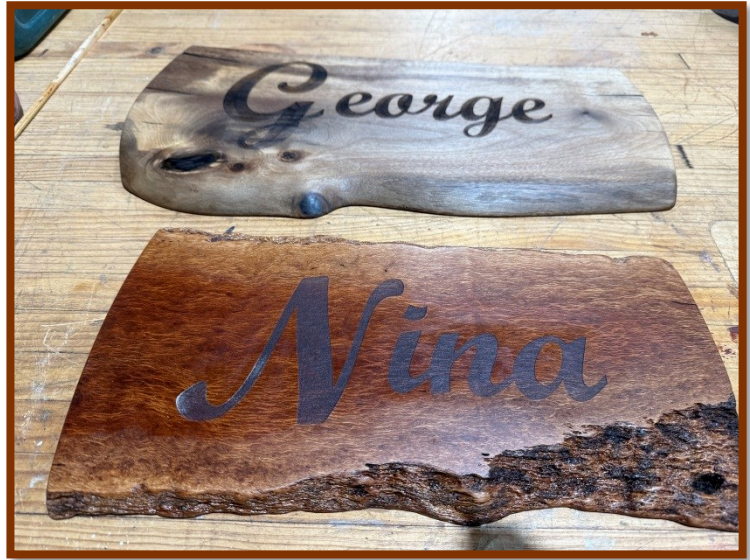
Names engraved with the CNC machine