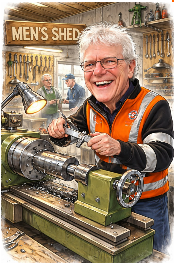
Mens Shed No 1 machinist