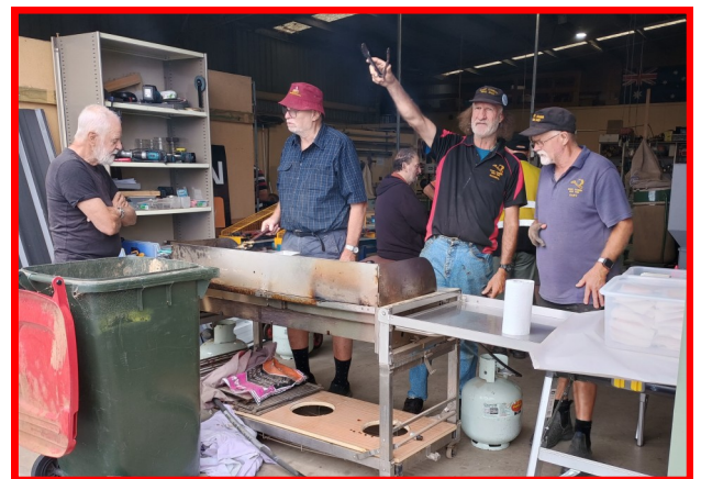
Above & below—monthly BBQ's