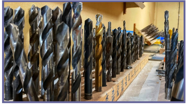
Which bit do I need?