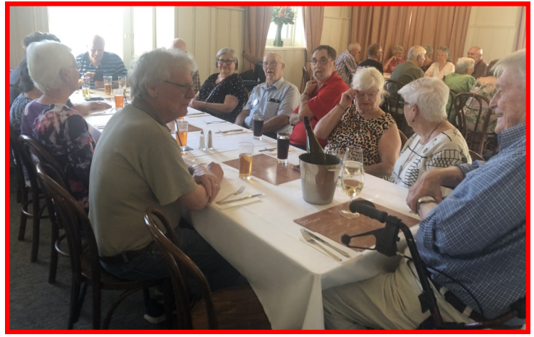
Members and partners meal at Mac's Hotel