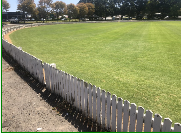
Current Frew Park fence