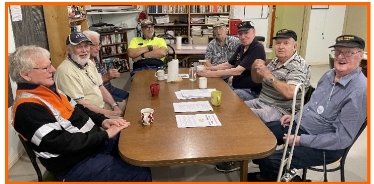
Members brewing trouble at morning tea