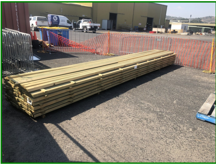
Above—6 metre main rails