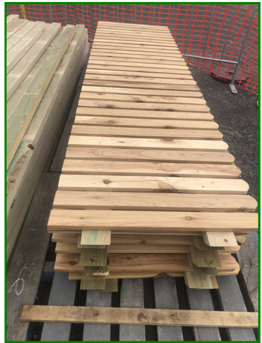
Some of the completed fence panels