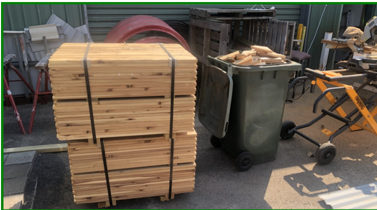
Bundle of pickets to be trimmed to size. Wheelie bin of off cuts