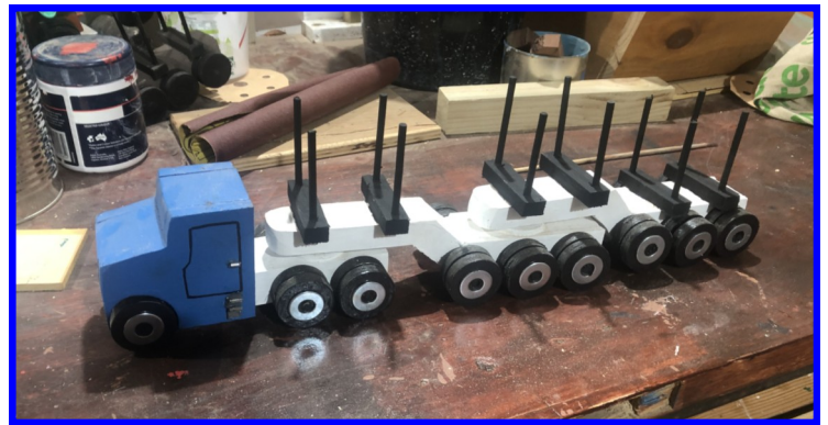
Above & below From humble bits of wood to a log truck A Toy Boy production