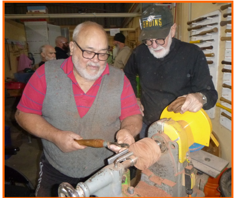
There are no mistakes in woodworking until you run out of wood.