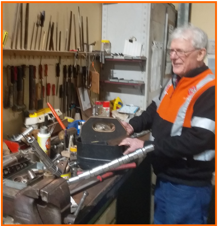
A socket tree by Jim T—a way of keeping them in line when you don't have a box