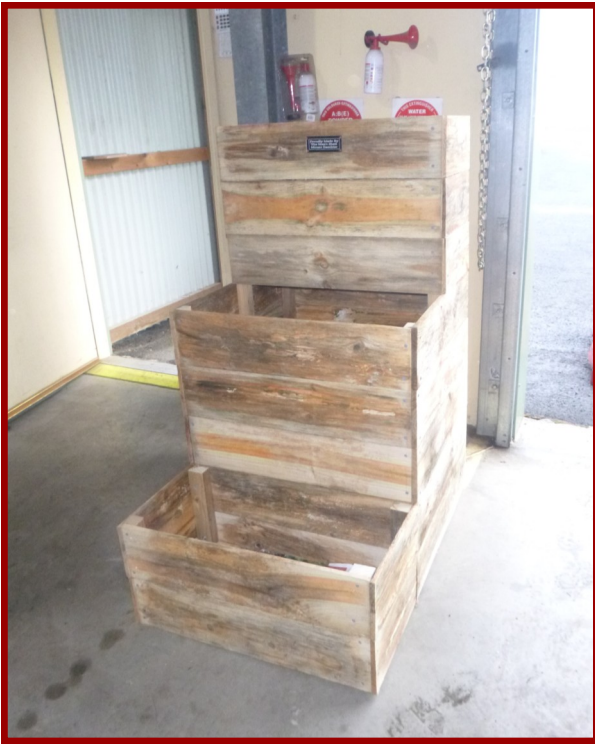
A multi deck pot plant holder made from pallets