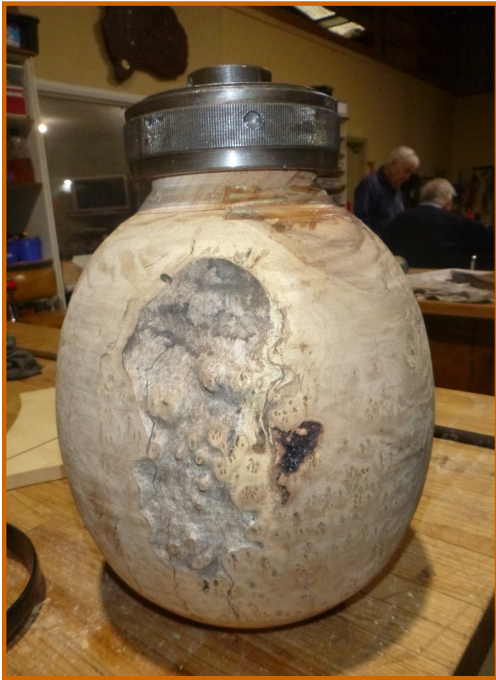
Turning up a beautiful burl