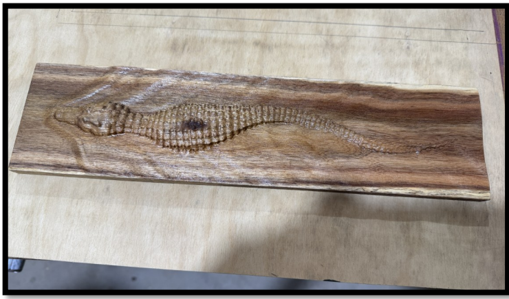
Creations made by David H on his CNC machine at home Great examples of what these machines can do Above—crocodile Below—fingers pulling the timber apart