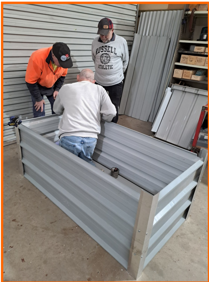
Looks like two supervisors are required for this job