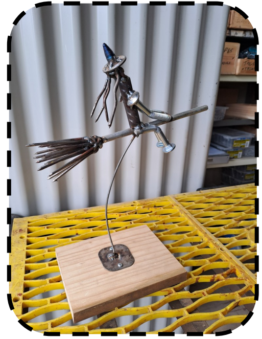
Ian A's witch on a broomstick