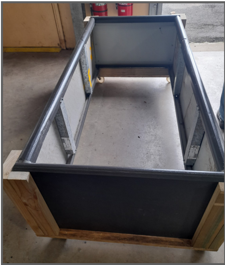
A special order mobile raised garden bed on castors made from sliding door panels