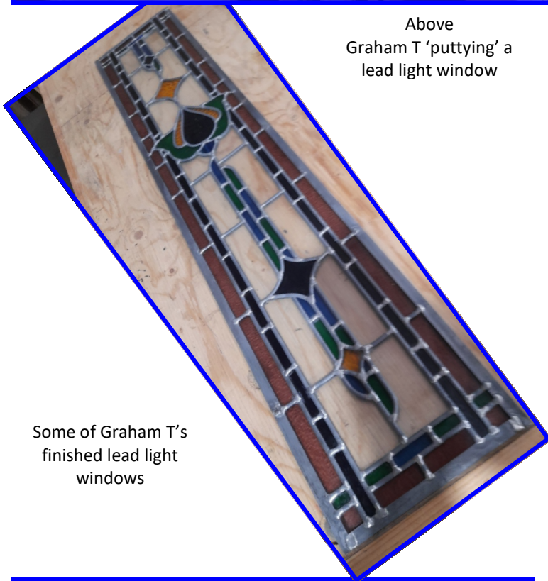
Some of Graham T's finished lead light windows