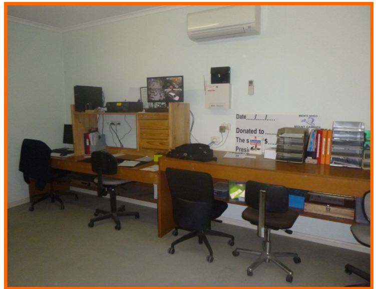
Above and below—the rearranged new look office