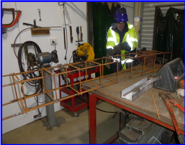
A whopper of a trellis for a vine by Trevor A