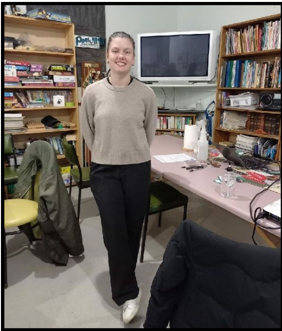
Domique presented eye health and diabetes talk 'Good Vision for Life'